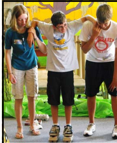
"One of these youth wasn't exactly excited about coming to VBS - then discovered being a leader is fun."